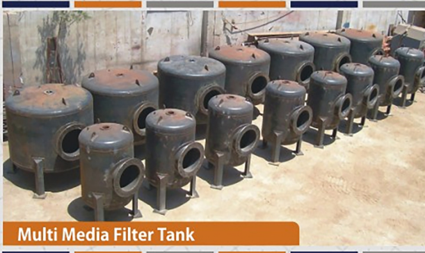
Multi Media Filter Tank