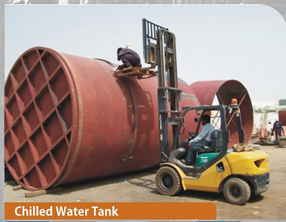
Chilled Water Tank