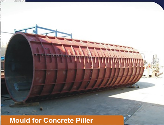
Mould for Concrete Pillar