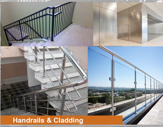
Handrails & Cladding