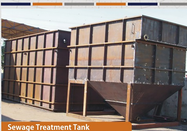
Sewage Treatment Tank

Precision Machining and Manufacturing of Components. (Manufacturing of accurate Components like Shaft, Sleeves, Couplings, Dies and Moulds, Machined Brackets, Stud Bolts and Non Standard Special Bolts & Nuts)